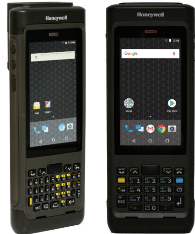
The CN80G ultra-rugged mobile computer provides iron-clad security for U.S. government agencies and contractors, with certifications for FIPS, STIG, and DOD8500.

Built on the Mobility Edge™ platform, the CN80G device offers an integrated hardware and software platform that enables customers to accelerate provisioning, certification, and deployment across the organization. The only platform that offers guaranteed compatibility through Android™ R, Mobility Edge devices promise a product lifecycle extending across four generations of Android to maximize return on investment and provide a lower overall TCO.